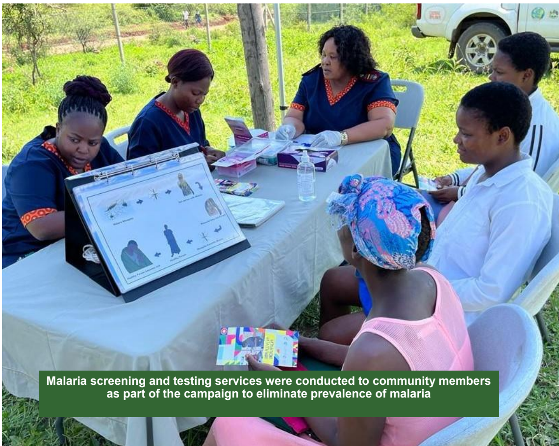
Malaria screening and testing services were conducted to community members as part of the campaign to eliminate prevalence of malaria