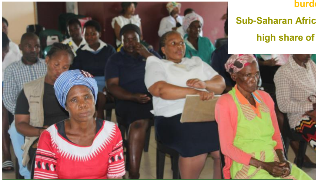
Community members from Mbadleni and surroundings attended the event

Sub-Saharan Africa carries a disproportionately high share of the global malaria burden.